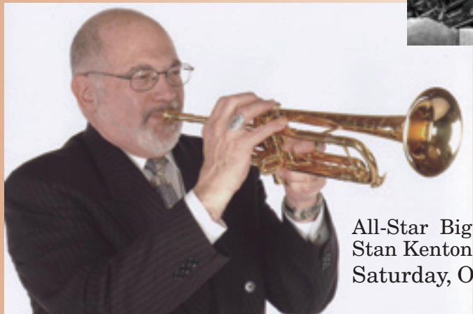
All-Star Big Band featuring Stan Kenton Alumni Saturday, October 6 9:00PM