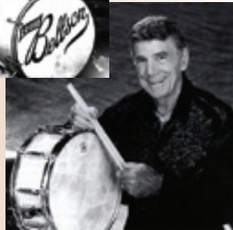
LA Jazz Orchestra Film Music of Duke Ellington Thursday, October 4 9:00PM