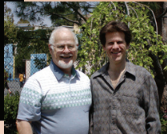
The Fischer Big Band Saturday, October 6 2:30PM